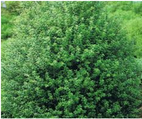
Pittosporum Mountain Green