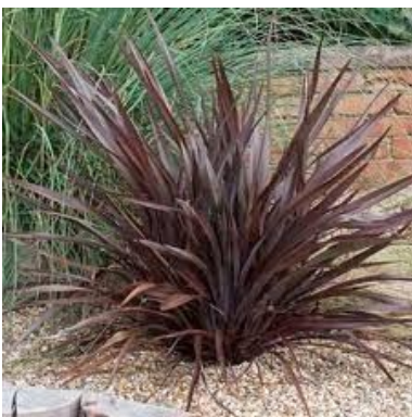
Phormium Dark Delight